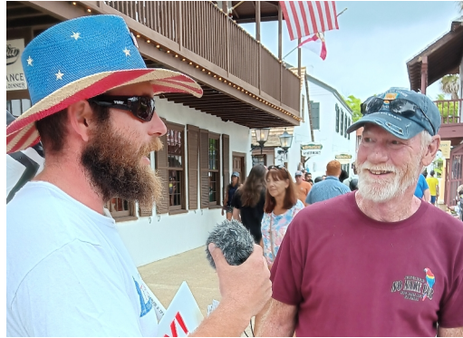
TCCR Staff Photos

https://rumble.com/v2f2v6y-st-augustine-tea-party-conversations-with-the-people.html