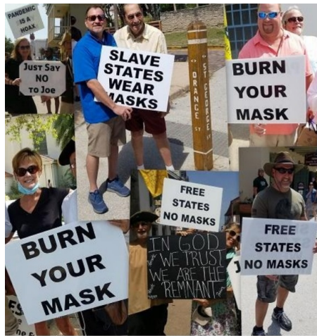
TCCR Staff Photos 3-23-21

Count played the part. Town Criers were in Attendance.